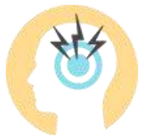
Increased risk of diabetes, heart disease, & other health problems