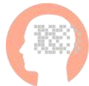
Concentration and memory problems