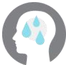
Fatigue & lethargy

Everyone experiences trouble sleeping from time to time but problems may occur when regular disturbances happen frequently and these can begin to affect your daily life.