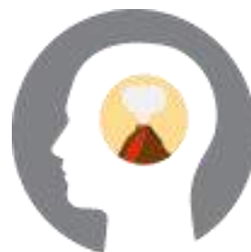
Moodiness and irritability