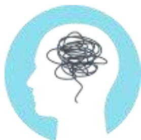
Difficulty making decisions