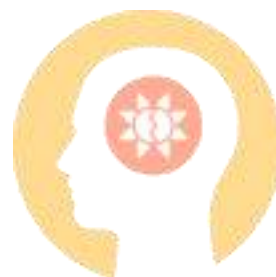
Reduced creativity and problem-solving skills