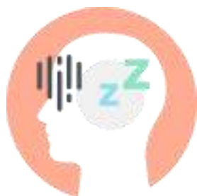
Lack of motivation