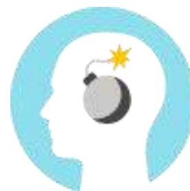
Inability to cope with stress