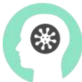
Frequent colds and infections