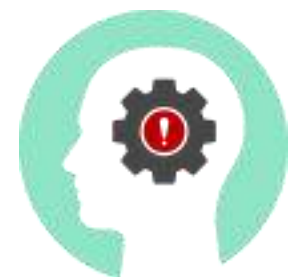
Impaired motor skills & increased risk of accidents